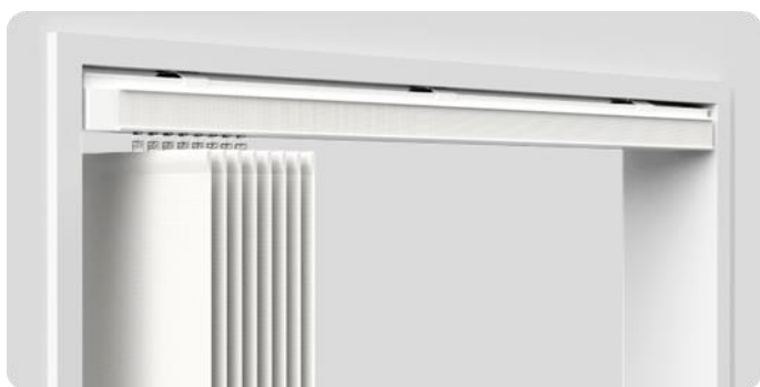
figure 6: installed blind with vanes attached