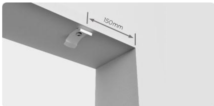
figure 1: clips set at about 150mm from the side of the window