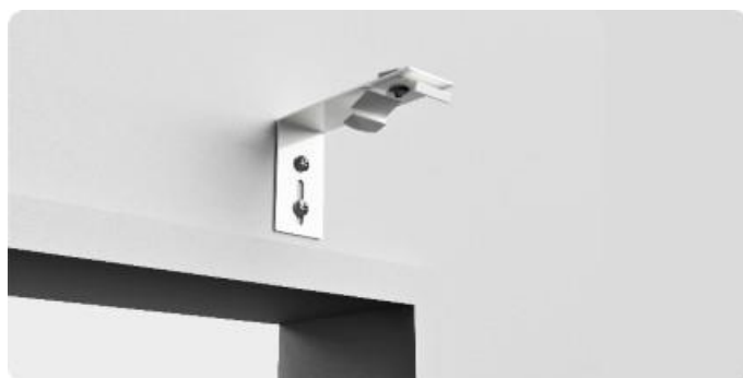
figure 3: outside fit brackets