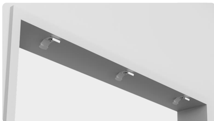
figure 2: clips evenly spaced along window reveal